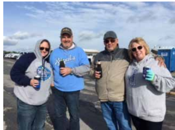
A great group of people.