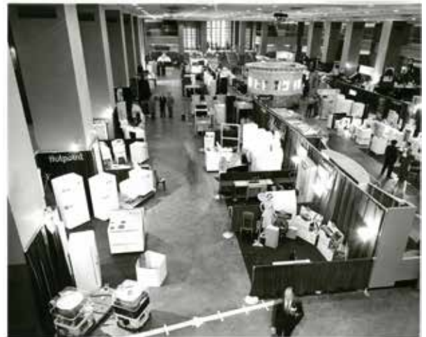
Historic Electric Association Trade Show