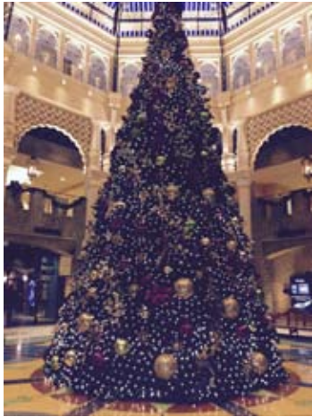
December 12 at the Argosy Casino, Kansas City, Missouri

Many thanks to these companies who made the Foundation prize raffle possible