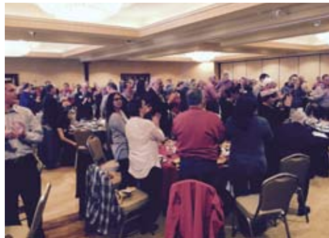
A standing ovation during the luncheon.